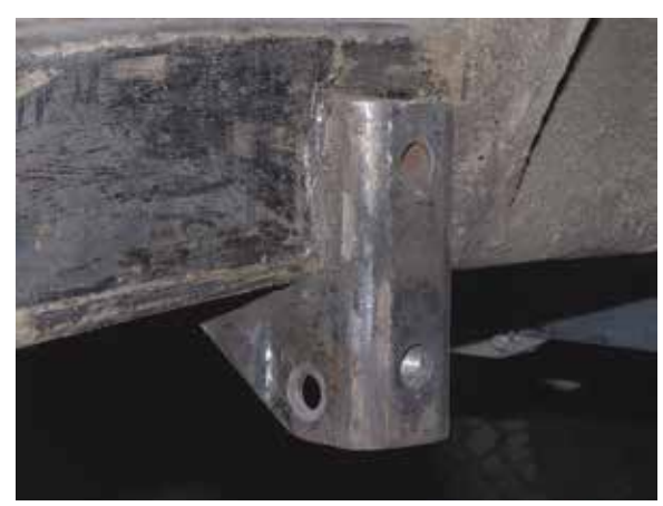
Stock 66-75 track bar drop bracket Do not cut off